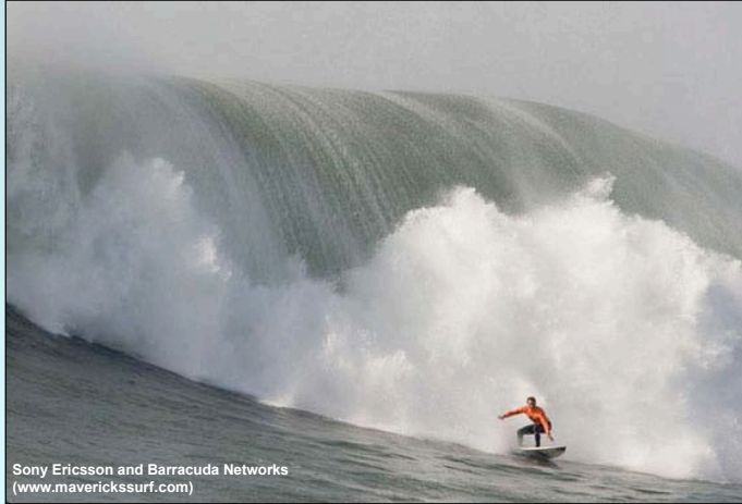
Sony Ericsson and Barracuda Networks (www.maverickssurf.com)