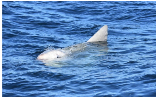
Shark or sunfish? Mola molas, or ocean sunfish, swim with shark-like dorsal fin upright; these fish often lie on their sides at the surface, uprighting themselves when traveling or startled.

Greater Farallones education staff partnered with the Oceanic Society to provide an opportunity for 40 Sanctuary Explorations participants to see the Farallon Islands and look for wildlife on October 20, 2019. The group encountered a gray whale, humpback whales, several mola molas (ocean sunfish), and many seabirds including common murre, cormorants, brown pelicans, black oystercatchers, and surf scoters. Participants learned about the natural history of whales, pinnipeds and seabirds along with the conservation efforts to protect these amazing species. In addition, they learned about good whale watching practices and etiquette.