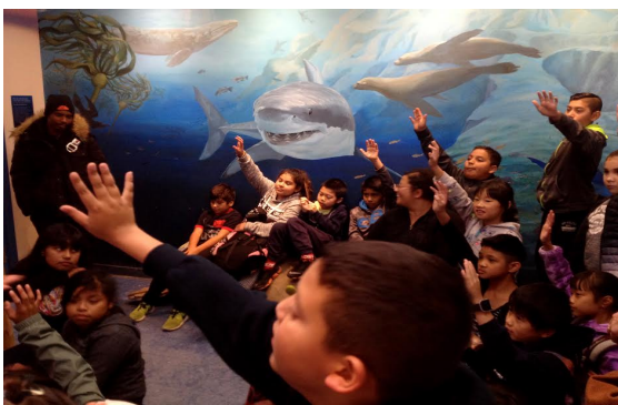
GFNMS Visitor Center provides valuable science education to Bay Area students.

School programs include plankton netting for view under a microscope, searching for shore crabs, and activities in the Visitor Center to learn about animal adaptations. Students take part in indoor as well as outdoor activities on adjacent Crissy Field.