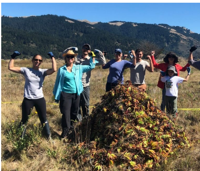
"Mission Ice Plant Doom" team strikes fear among alien invader succulents on Kent Island, Bolinas Lagoon.