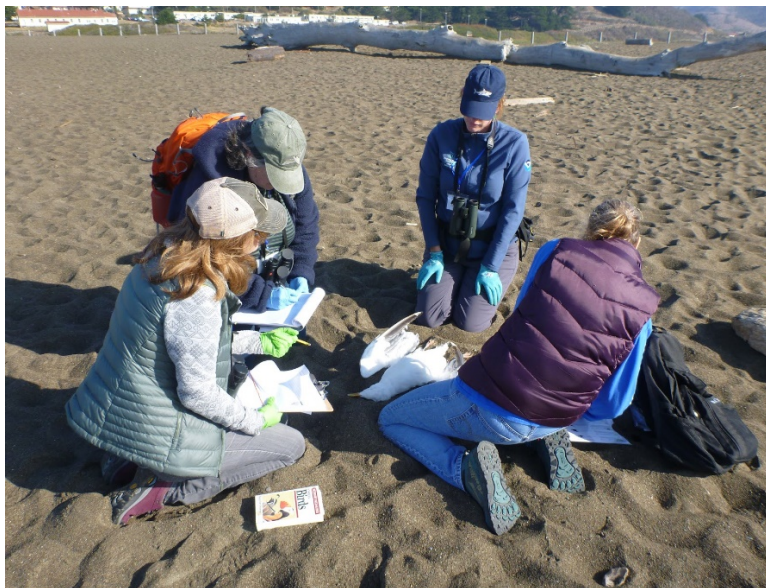
Demonstrating how to document a dead gull on a practice beach survey.