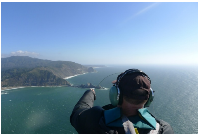
A pilot from the Half Moon Bay Pilots Association points to a sensitive seabird area at Devil's Slide Rock in Pacifica, California.

Promoting responsible tourism through relationships with leaders in the recreational aviation community is crucial to raising awareness of sensitive marine wildlife, NOAA Regulated Overflight Zones, and sanctuaries while allowing for compatible uses. The conference also strengthened relationships with agency partners from the FAA and NTSB.