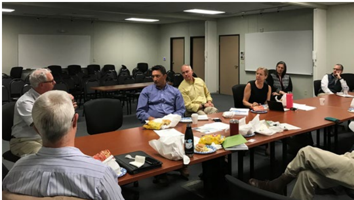
Farallones staff and members of the shipping industry, air district agency partners, and conservation research partners gather to discuss California voluntary VSR efforts.

updates about the sanctuaries' efforts to reduce lethal ship strikes of endangered whales via the voluntary speed reduction.